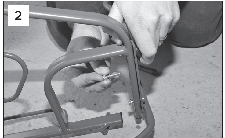
2 Secure bracket with bolts and tighten with 10mm spanner.