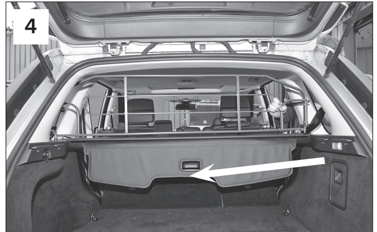
4 Lower rear seats and insert the dog guard.