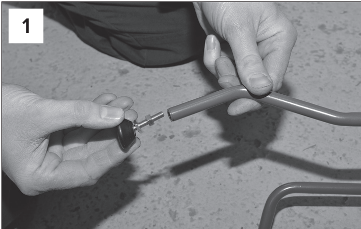
1 Insert rubber feet into bracket.