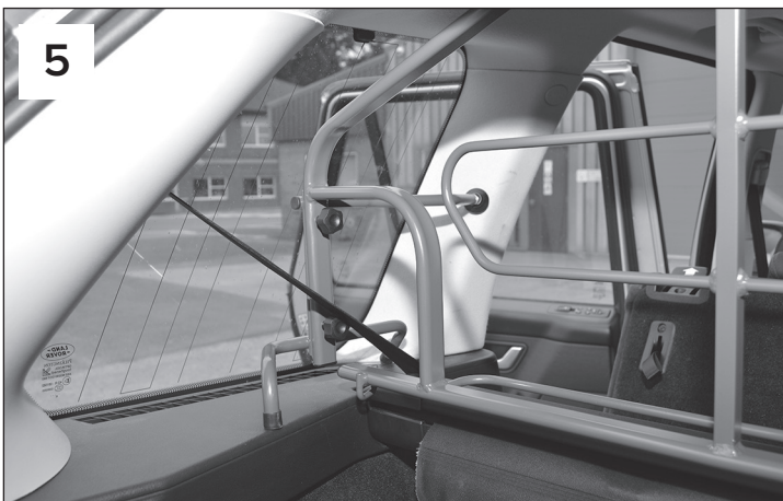
5 Ensure seat belt runs through the guard as shown. Tighten rubber feet.