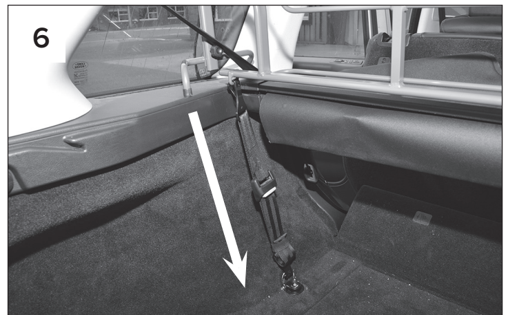
6 With guard in place, clip the securing belt into place and pull the belt to tighten.